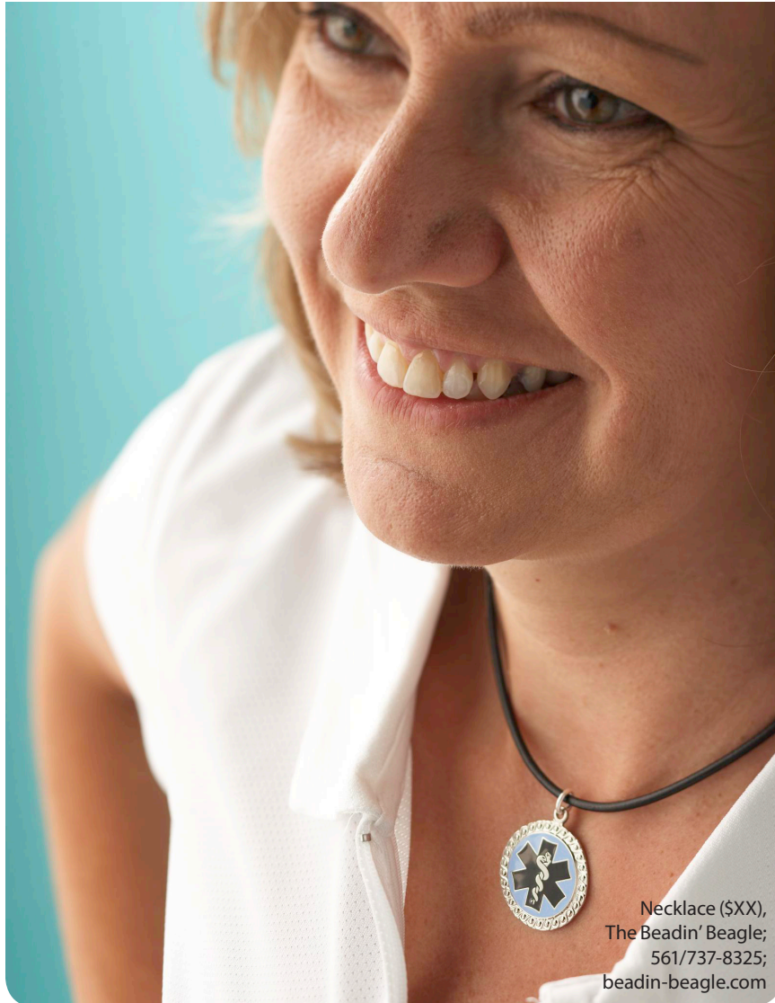
Necklace ($XX), The Beadin' Beagle; 561/737-8325; beadin-beagle.com