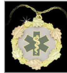
Shown with Rose Cloisonne Insert

Solid gold frames with engraved inserts. As medical or personal information changes, new inserts can be ordered. The information on the backs is engraved into the metal, but often, because it's easier to read, we add a thin engraved disc and place it over the back. Includes 24" gold filled chain. Updated inserts are $32.00.