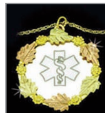
Shown with Sterling Silver Insert