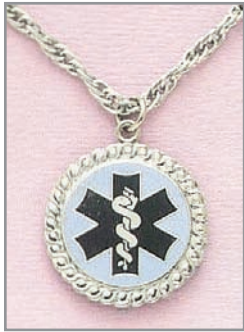
Enameled Medical Necklace Item D Red or Blue

Medallion is one inch. Red has gold trim and blue has silver trim. Red medallions have gold chains and blue medallions have silver chains.. Chains are 24" with a clasp. $19.95