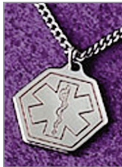
Dogtag Style Necklace K

This item is all stainless steel. The tag itself is about the size of a quarter (7/8" from tip to tip). Easy to wear. Small enough for children. Up to nine lines engraving. $14.95