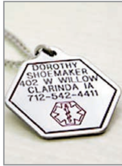
Stainless Steel Necklace Item C

Hexagon shape. Engraved with five lines on the front, up to 10 lines on the back. 1-1/4" tip to tip, about the size of a 50-cent coin. Includes 27" stainless steel link chain. Can be longer or shorter, with a clasp. $14.95