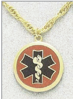
Enameled Medical Necklace Item F Red or Blue

Medallion is one inch. Includes ladies 24" rope chain as shown or 27" stainless steel link chain for men. An optional gold plated stainless steel link chain is also available. $19.95