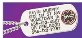
Stainless Steel $19.95

Dogtag Style Necklace K in Stainless Steel or Sterling Silver. Plate size is 3/4" x 1-1/2"