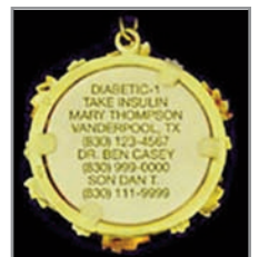
Child Necktag JRN